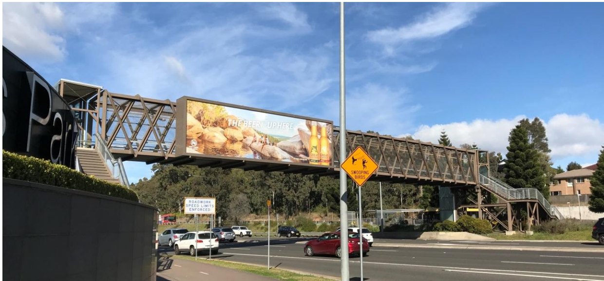
Figure 3 Example Advertising on Bridges

The example below shows this form of signage which was completed on behalf of NSW Roads and Maritime Services.