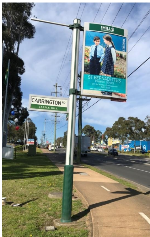
Figure 2 Example Advertising on Street Signs

There are also potential opportunities for advertising to be placed on bridges (such as pedestrian bridges) over major road corridors. A pedestrian bridge has recently been constructed by Council over Windsor Road, Kellyville and there are a number of planned pedestrian bridges within the Balmoral Road Release Area and commercial centres such as Castle Hill and Baulkham Hills. While Council does not currently have any advertising structures on bridges within the Shire, there may be opportunities to do so in the future as part of existing and/or future bridge infrastructure.